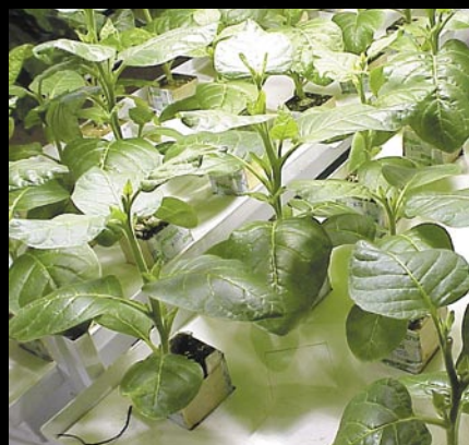
Tobacco plants thriving in an AquaFlow system