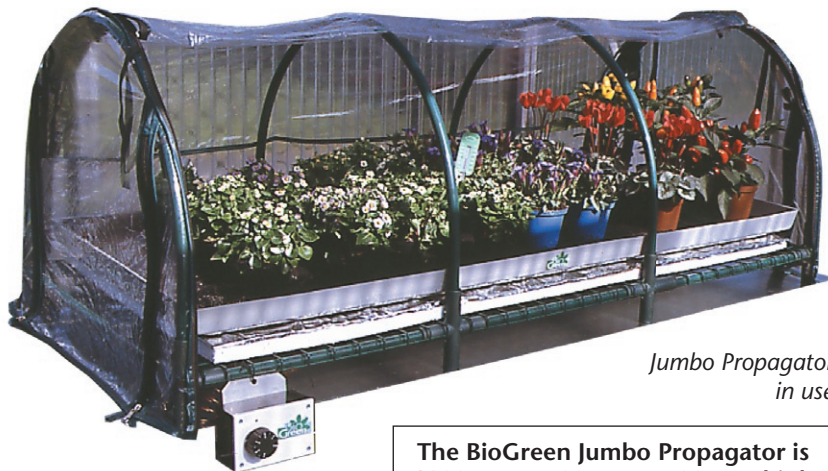
Jumbo Propagator in use

The BioGreen Jumbo Propagator is 1200 mm x 500 mm x 500 mm high